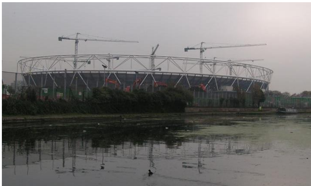
Olympic Stadium in full development

Before passing the industrial areas of the North Circular Road we cruise past more delightful areas such as Tottenham Marshes, Stonebridge Lock and Tottenham Lock. At Stonebridge there is the wonderful Watersedge Café where they serve excellent snacks, tea, coffee and cakes.