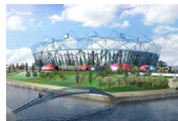
New Olympic Park

From its base on the River Lee we can cruise the waterways of London, Essex and Hertfordshire for a day, a week or even longer. Just 20 minutes away is the new 2012 Olympic Stadium. Although still under construction, in years to come this will be one of the premier destinations for our boat. Plans are in progress for numerous river side developments to enhance the River Lee and surrounding areas.