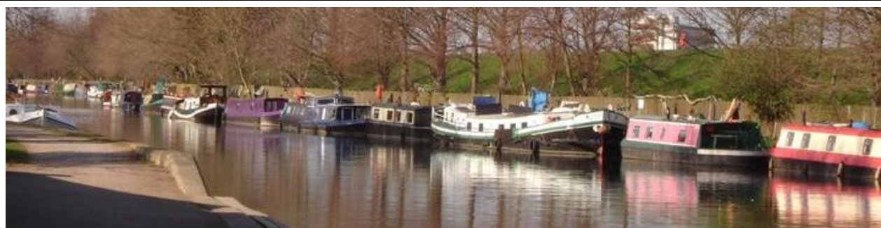
Riverside at Springfield Park

Other combinations of day trips and holidays can be arranged in discussion with our volunteer team on 07511 622747