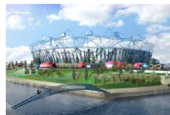
New Olympic Park

From its base on the River Lee we can cruise the waterways of London, Essex and Hertfordshire for a day, a week or even longer. Just 20 minutes away is the new 2012 Olympic Stadium. Although still under construction, in years to come this will be one of the premier destinations for our boat. Plans are in progress for numerous river side developments to enhance the River Lee and surrounding areas.